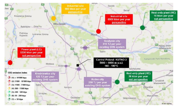
Figure 2: Map showing the Kutno area, three district heating systems in nearby municipalities and potential (perspective and not perspective) CO_2 sources.

For Mogilno-Łódź Trough (Kutno area), a detailed analysis regarding the potential CO<sub>2</sub> sources, as well as nearby (from 2 to 15 km) heat demand in district heating systems, was done. As presented in Figure 2, the area has potentially favorable temperatures between 160 and 190 °C at depths of 5000 to 6000 meters below sea level. In the near vicinity, significant perspective industrial CO<sub>2</sub> sources were identified, associated with the refineries and their power generation plants. Other nearby CO<sub>2</sub> sources, mainly the lignite-fired power plant in Pątnów, are rather not suitable long-term sources of carbon dioxide, due to the planned decommissioning in the coming years.